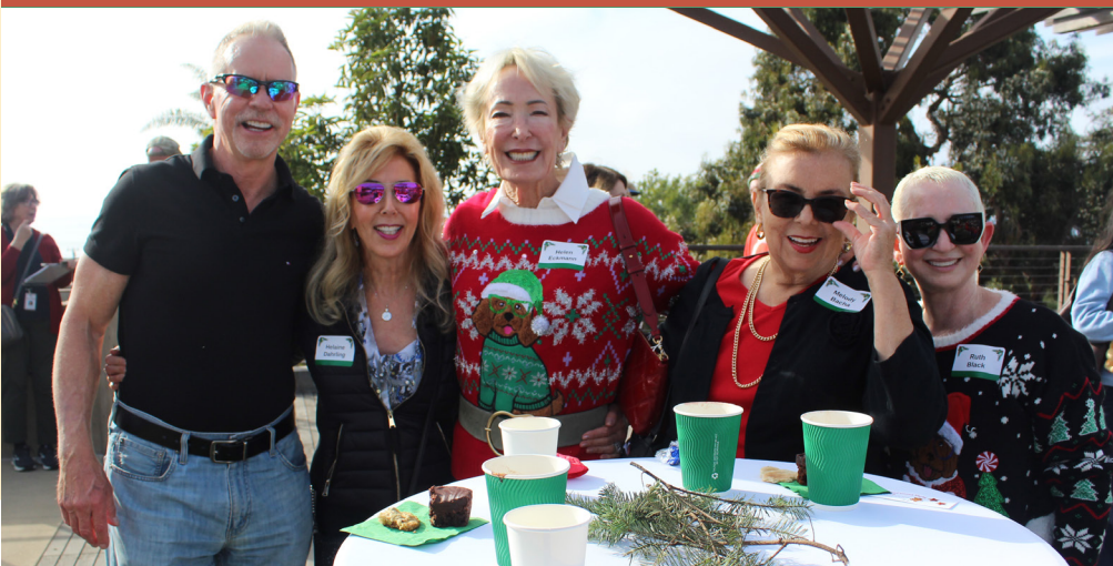
Meeting up with new and longtime friends at the Cookies and Cocoa Holiday Party

546 meals were served to INAs as part of Tuesday Lunch Connections supported by a grant from the Del Mar Foundation