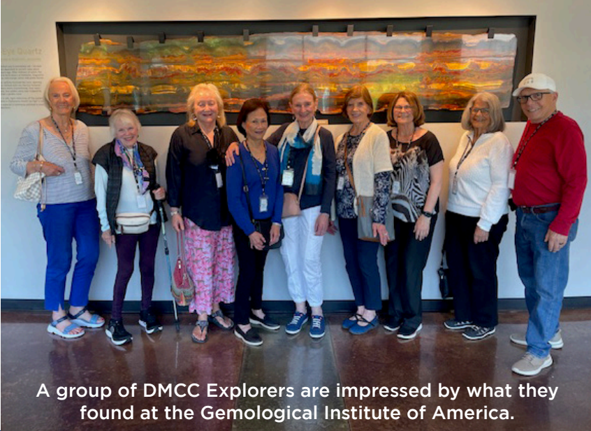
A group of DMCC Explorers are impressed by what they found at the Gemological Institute of America.